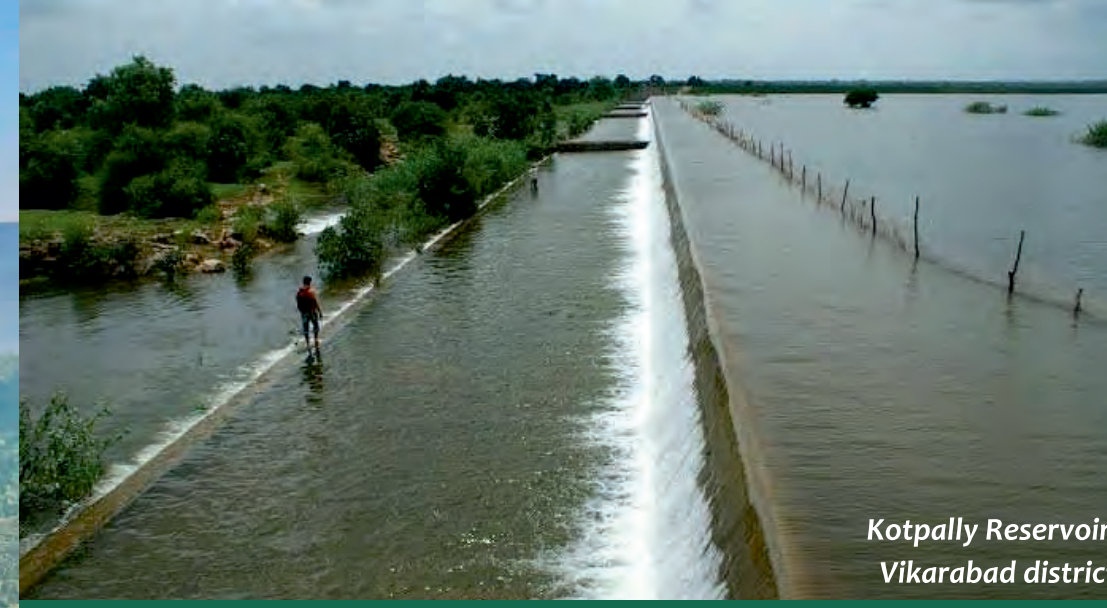
Kotpally Reservoir, Vikarabad district

With growth and appreciation bound to turn upwards in the coming years, the current prices are ideal for those seeking to sell and exit in 2 – 5 years, while making a handsome profit.