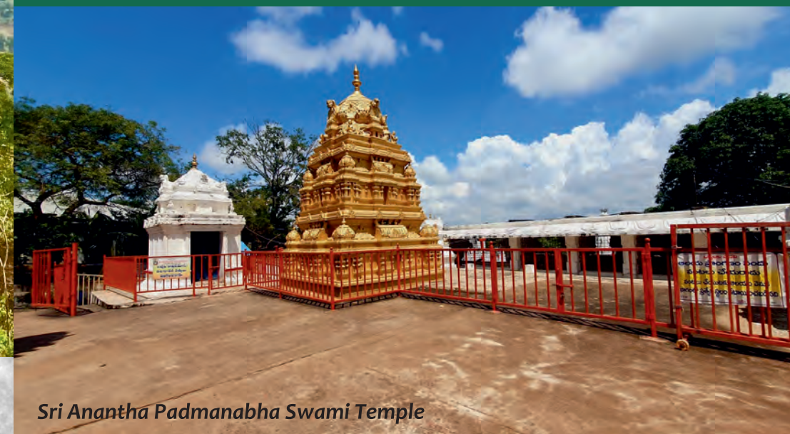
Sri Anantha Padmanabha Swami Temple